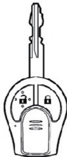
2 Button Remote Type

The alarm system is armed when the Remote Control is used to lock the car.